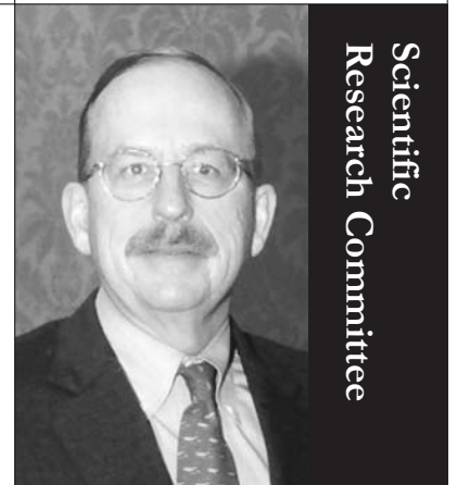
Scientific Research Committee